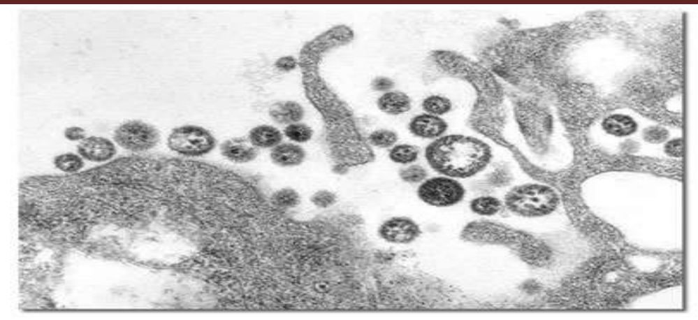
Figure 2. Arenavirus images showing protein inside of image.

Impact Factor 3.582 Case Studies Journal ISSN (2305-509X) - Volume 5, Issue 7-July-2016