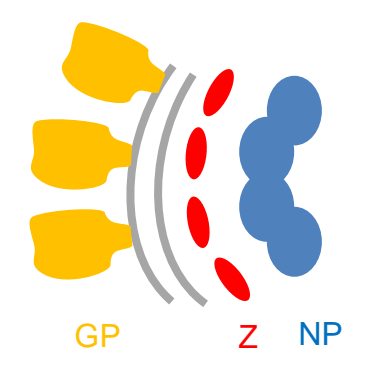
Figure 3. Model showing how the arenavirus structural proteins GP-C, Z and NP are arranged in virions. The viral envelope is shown in grey.

The Nucleoprotein (Mr 60-68kDA) is the most abundant viral polypeptide both in infected cells and in virions (about 1530 NP molecules per virion particle). The NP is the main structural element of the viral nucleocapsid and associates with the genome RNA to form beadlike structures . The phosphorylated forms of the NP are usually detected at late stages of acute infection, and their abundance increases in persistently infected cells; however, the functional implications of these changes in the stage of NP phosphorylation have not been established (6). The location of GP, NP and Z in the virion is described in Figure 3.